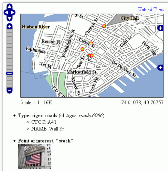
Output with Thumbnail Image